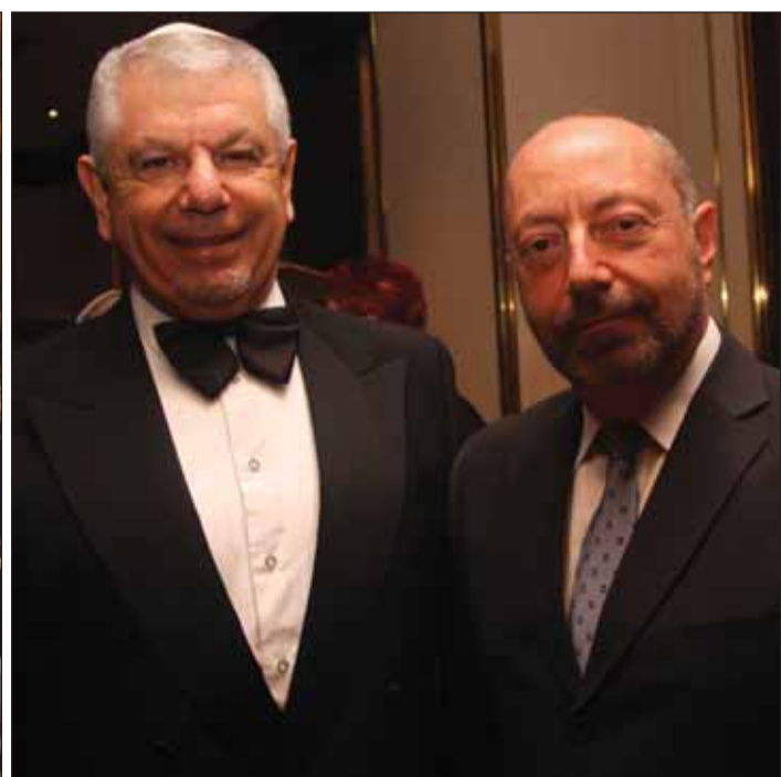
Stan Kaplan with Israeli ambassador Dov Segev Steinberg.