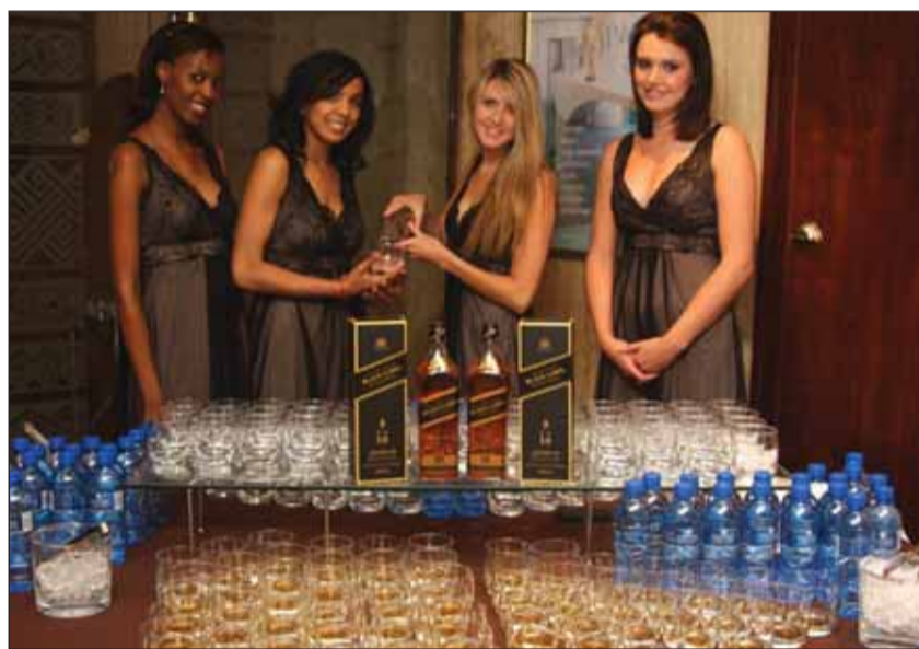
The Johnnie Walker girls with drinks from sponsors Johnnie Walker and Valpr .

He also chaired the United Nations Committee on Governance and Oversight.