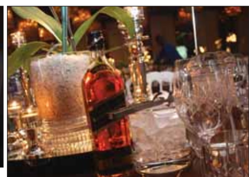
One of the sponsored bottles of Johnnie Walker whisky displayed on the tables.