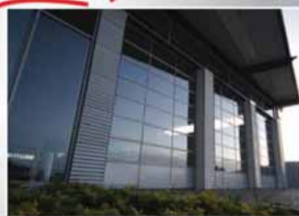
SECTIONAL OVERHEAD DOORS