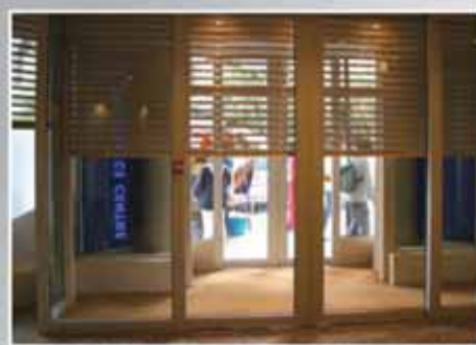
PERFORATED ROLLER SHUTTERS