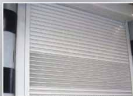
ROLLER SHUTTER DOORS