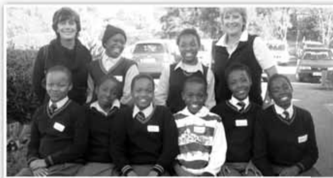
Learners from Alexandra Township with their bridge teachers from SABF

Learn and play bridge All ages & stages of life (10 – 90)