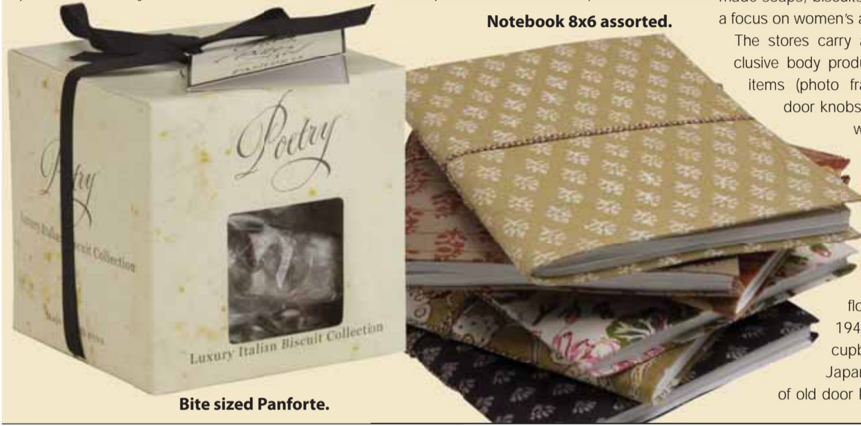
Bite sized Panforte.