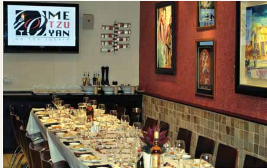
Our Salon Prive is the ideal option for private business meetings with audio-visual facilities for presentations as well as smaller private celebrations.

WITH YEAR-END functions coming up, Metzuyan - on the square is the perfect venue for your function of any kind, be it large or small, festive or reserved, loud or relaxed.