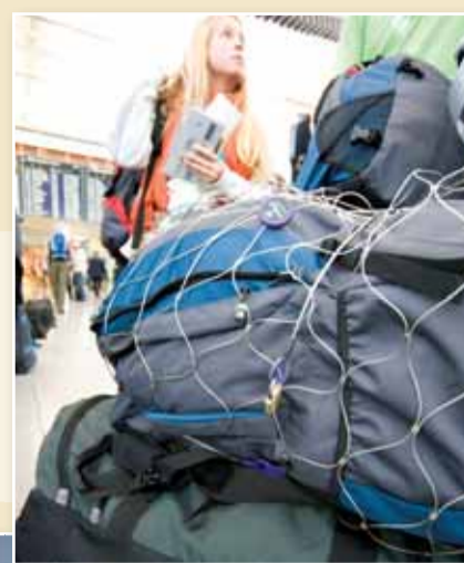
Top right: K-Way Travel Bag protected by Pacsafe stainless steel locking device.

Visit www.capeunionmart.co.za for more information or consult your nearest Cape Union Mart store.