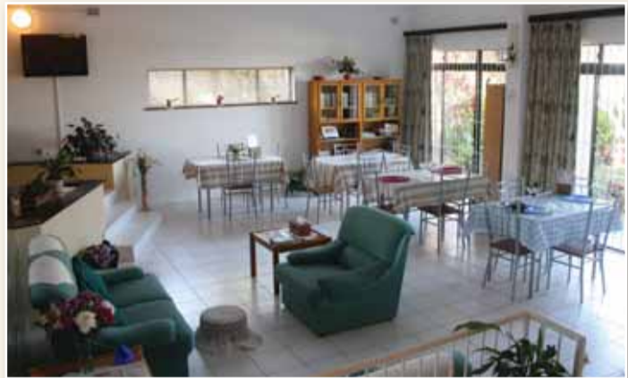
Part of the dining room and lounge. Ready-made kosher meals and a la carte menu available.

Umhlanga Kosher Accommodation is situated in the heart of this beautiful coastal resort town. Guests have the choice of staying in the bed & breakfast suites or choosing the kosher self-catering chalets. The Umhlanga Kosher Accommodation has everything to offer the holidaymaker or business person, with tropical surroundings, style, comfort combined with warm hospitality and personal service.