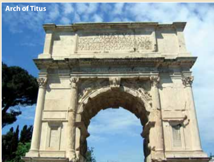
Arch of Titus