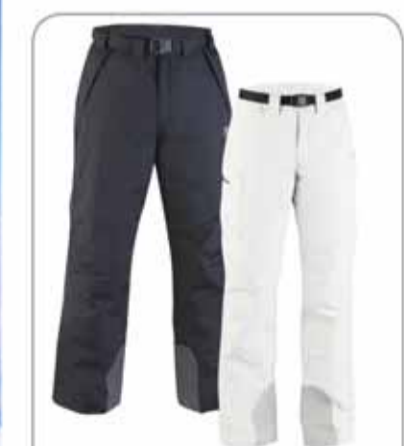
Men's Method & Women's Ariel Ski Trousers R850 each These ski trousers are padded with ThermoLite Plus which provides excellent insulation and ease of movement without unnecessary bulk. They are 100% windproof, and Velcro waist adjusters and a webbing belt create the snugest possible fit.