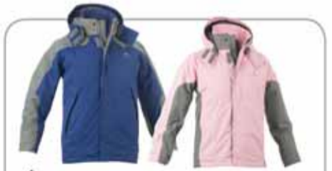
Kronk & Ezma Ski Jacket from R650 each

kids Cape Union Mart stocks a range of K-Way Kids technical skiwear including padded ski jackets, fleece tops, ski pants, gloves, scarves, beanies and more. K-Way Kids items are available for children aged 3 to 12 years.