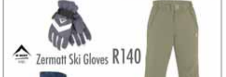
Zermatt Ski Gloves R140

kids Cape Union Mart stocks a range of K-Way Kids technical skiwear including padded ski jackets, fleece tops, ski pants, gloves, scarves, beanies and more. K-Way Kids items are available for children aged 3 to 12 years.