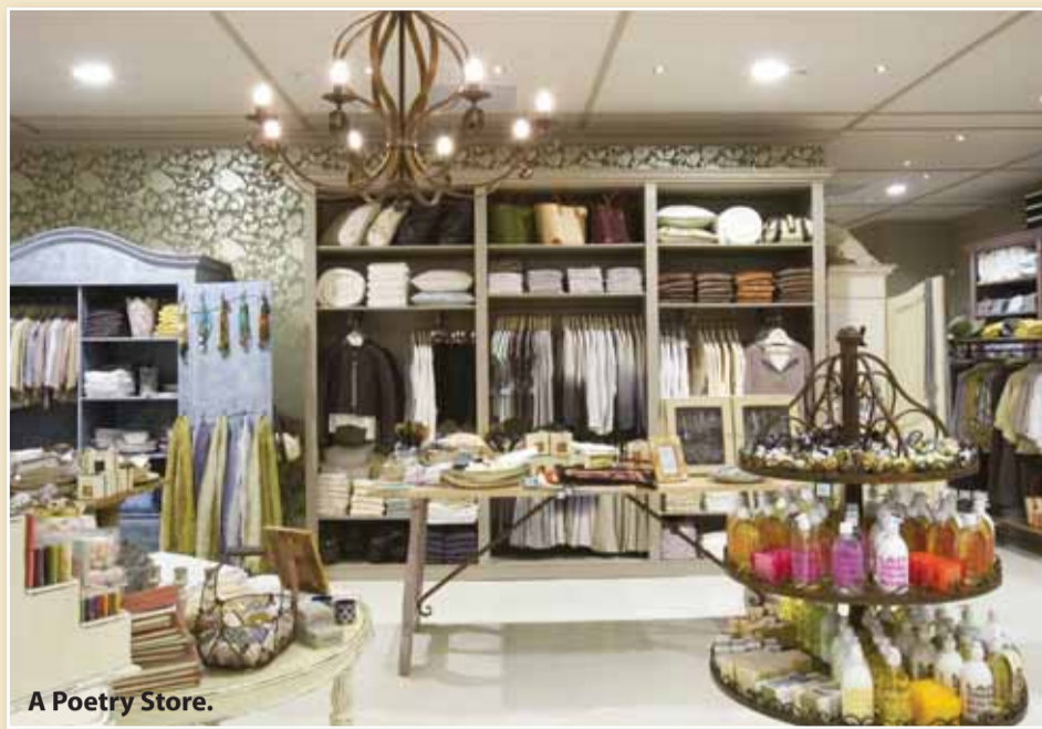
A Poetry Store.

Highlights for consumers at the Poetry stores include the unique and eclectic mix of everything from 100 per cent linen and silk pieces to hand-