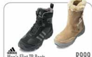
Men's Flint TR Boots R999 Durable winter boots for snowy or cold conditions with PrimaLoft insulation and special winter grip outsoles for maximum traction.