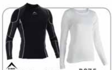
Men's Ski Thermal Ski Vest R375 each Technical thermal underwear made from an advanced thermal fabric known as Dry-Tech®. This provides maximum warmth with minimal weight. The fabric contains Microban antibacterial protection, which reduces odour-causing and potentially harmful bacteria on the garment. Long Johns also available.