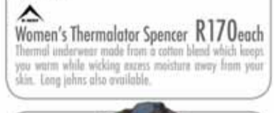
Women's Thermalator Spencer R170 each Thermal underwear made from a cotton blend which keeps you warm while wicking excess moisture away from your skin. Long Johns also available.