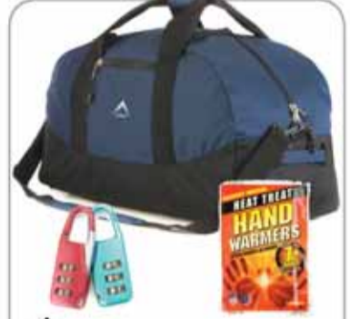
Evo Gear Bag (L) R350 With a capacity of 65 litres, padded shoulder straps for easy carrying and lockable YKK zips for extra security, this is the ideal travel bag. It also comes in small (R275), medium (R299), and extra large (R399).