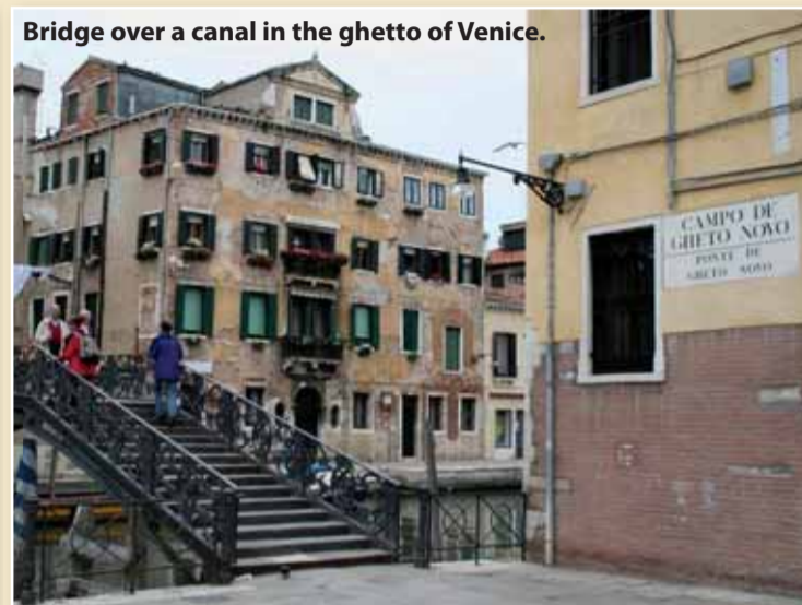
Bridge over a canal in the ghetto of Venice.