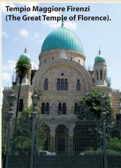
Tempio Maggiore Firenze (The Great Temple of Florence).