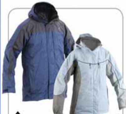
Men's Blizzard & Women's Mont Rosa 3 in 1 Jacket R1499 each These versatile winter jackets offers 3 jackets in 1 with a removable inner fleece top. The outer shell jacket is 100% waterproof, breathable and seam-sealed while the inner Thermalator fleece top is anti-pill and wicks moisture away from the body. Wear both together for a warm ski or winter jacket or just the shell as a rain jacket and the fleece for cooler winter days.