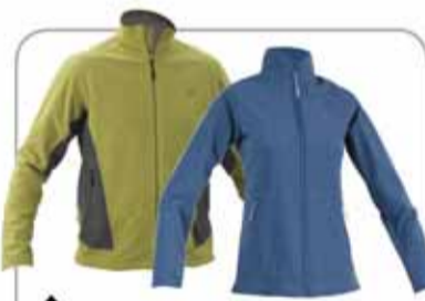
Men's Gallant & Women's Lola Fleece Top R399 each A versatile zip-up Thermalator fleece top with wickable technology to help move moisture away from the body.