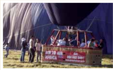
Happy landings are celebrated with champagne and orange juice.

Tranquil and calming are the word that most describe the experience. Balloons move with