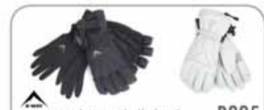
Men's Latok Twin Shell Ski Gloves R325 Women's Snow Flake Ski Gloves R199 Highly water resistant, breathable and windproof ski gloves with a Thinsulate lining for warmth and increased breathability. A leather palm patch allows for durability and grip. Latok comes equipped with a removable Spindrift liner.