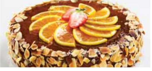
Delicious cakes at Europa.