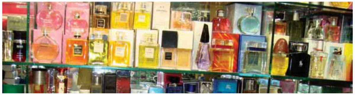
Famous brands - lowest prices.

SPRINGBOK PHARMACY is filled with floor-to-ceiling shelves that contain an enormous variety of items: from local deodorants to imported exotic perfumes; from babies' nappies to equipment for the disabled.