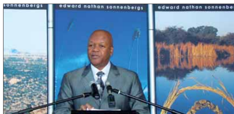
Minister of Justice Jeff Radebe, at the Edward Nathan Sonnenbergs podium, last week.