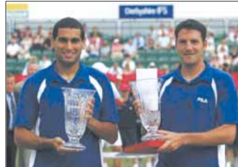
Andy Ram (left) and Jonathan Erlich.