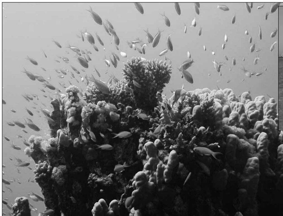
The artificial reefs in Eilat. "Our task is to understand which factors bring about the development and proliferation of coral reefs."

"Because of the increase in the number of visitors, the coral reefs are unable