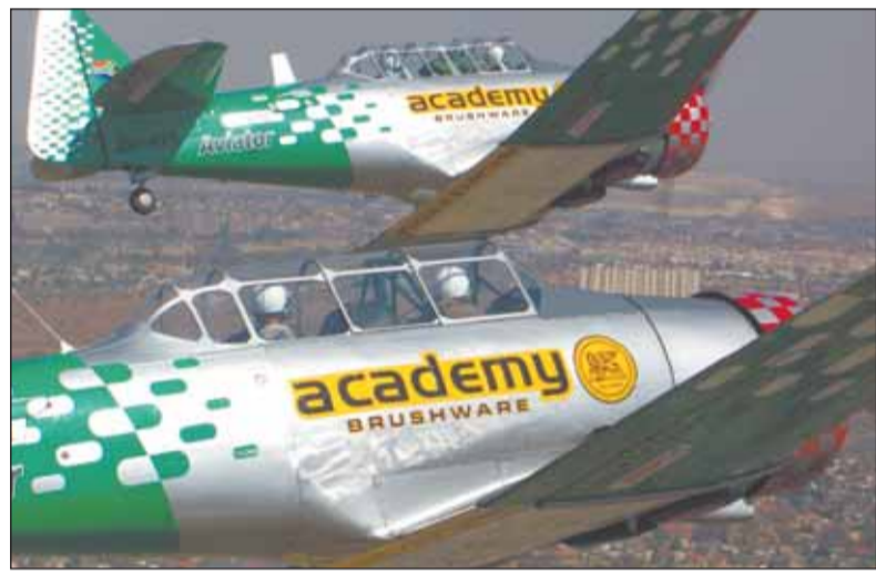
Missing Man formation From the Sky

Manna Bakery wishes all their customers and friends a happy New Year and well over the fast